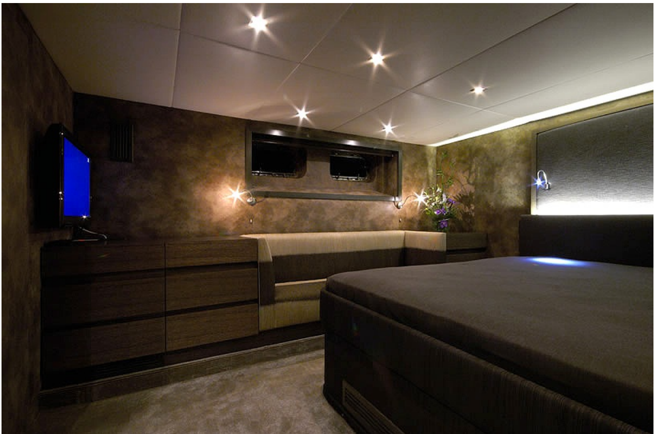
Master cabin b