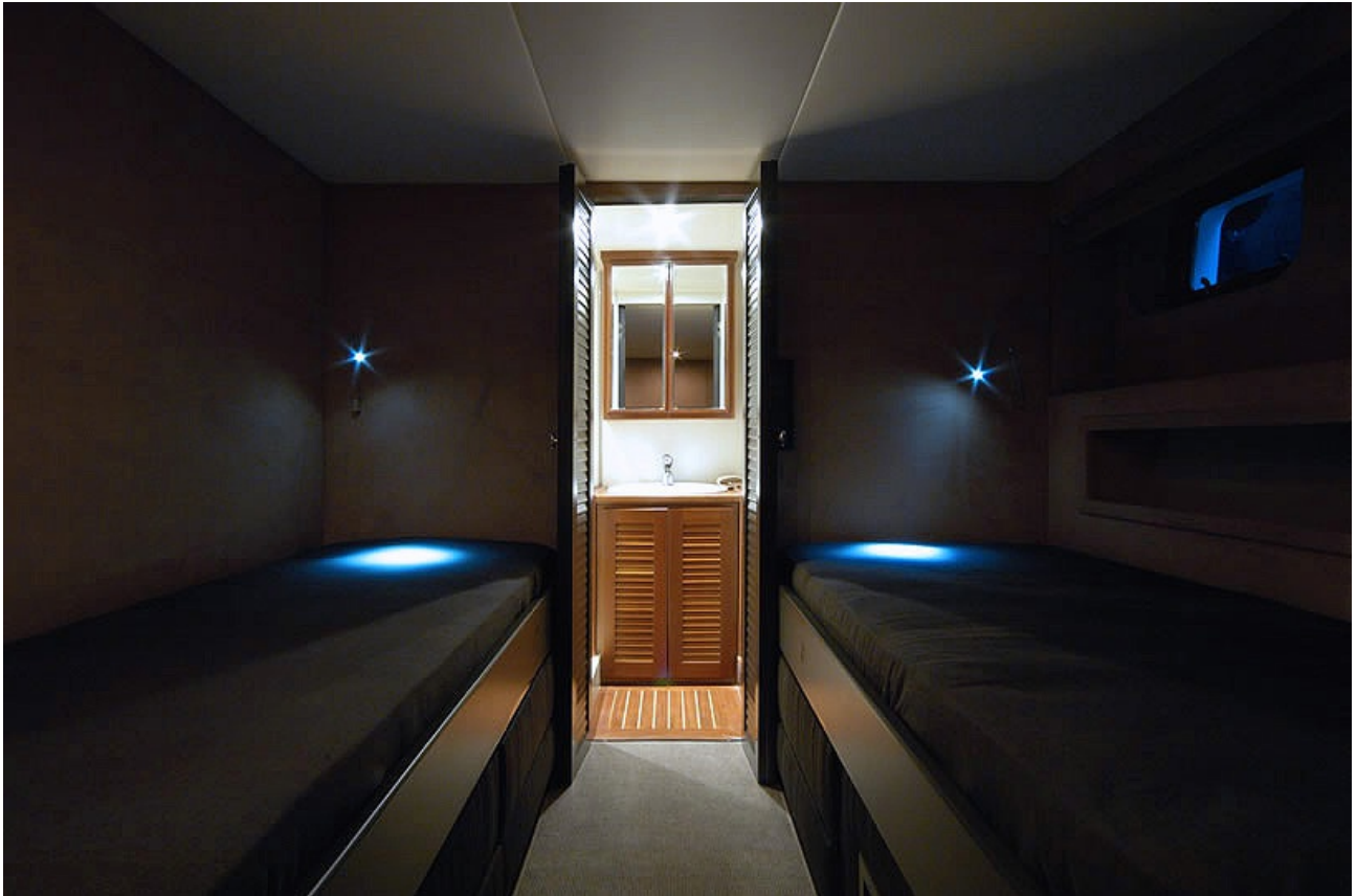
Twin Guest cabin