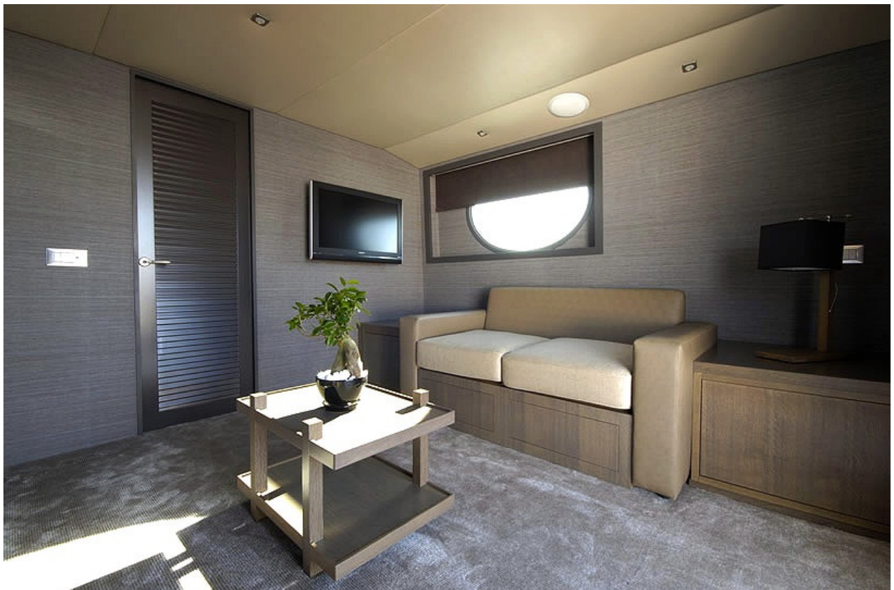
Upper Saloon b