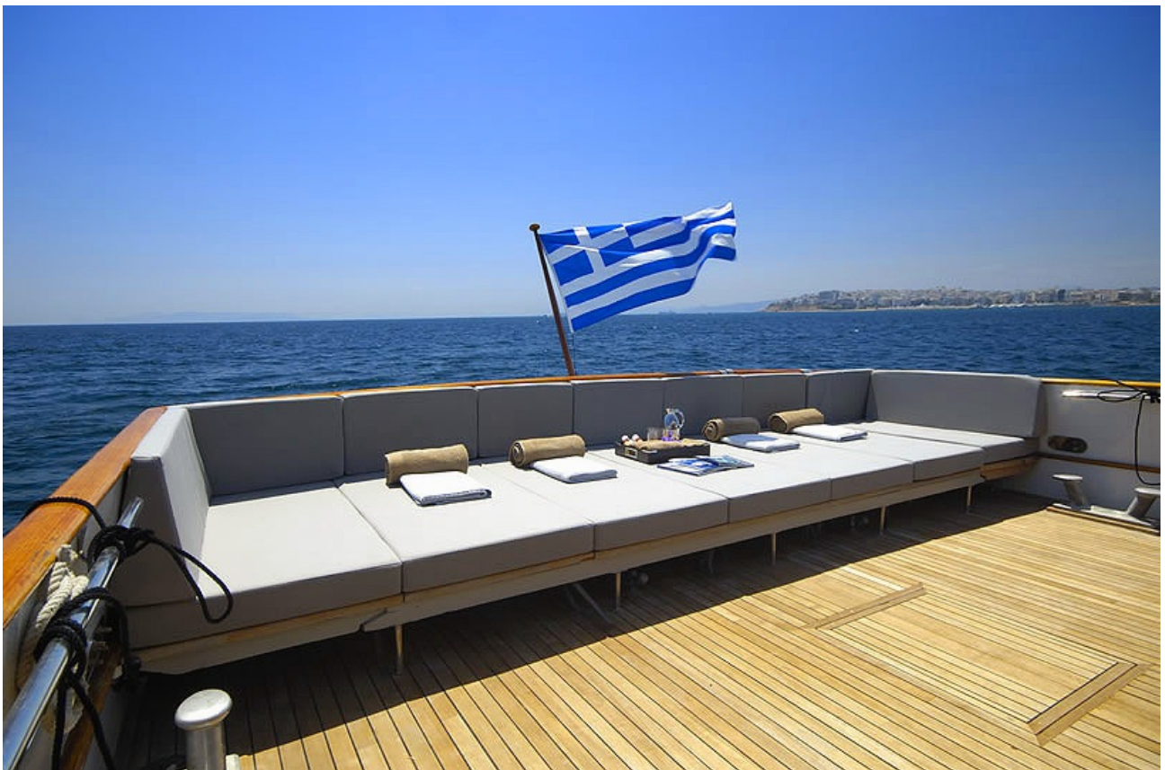
Aft deck b