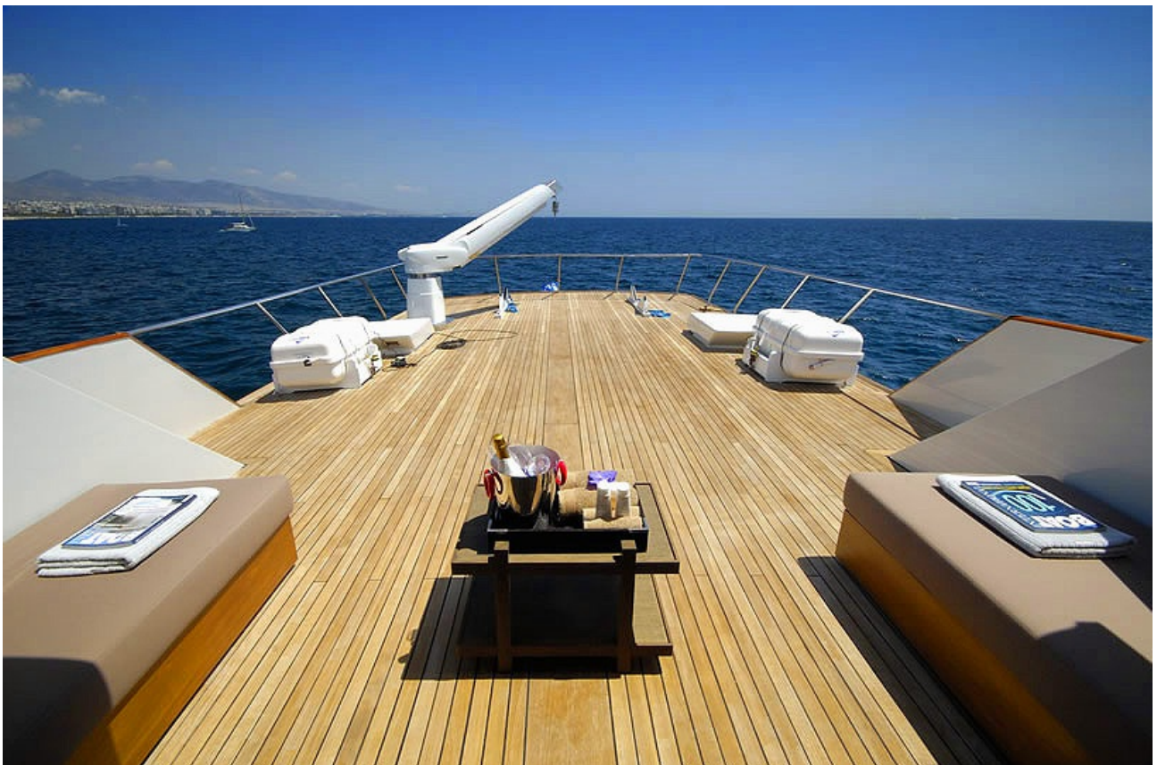
Upper deck b