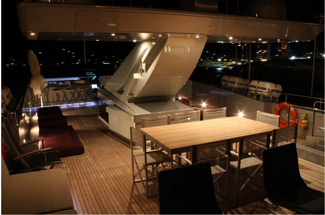
Upper deck c.JPG