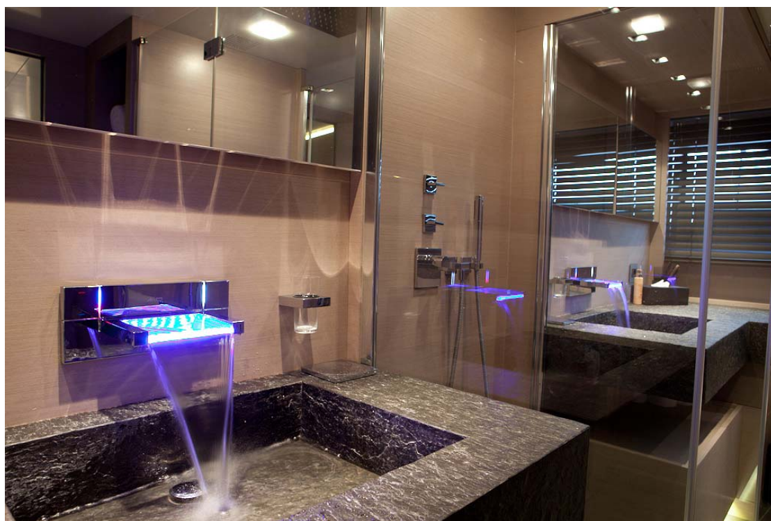
Master ensuite b.jpg