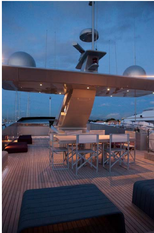
Upper deck b.jpg