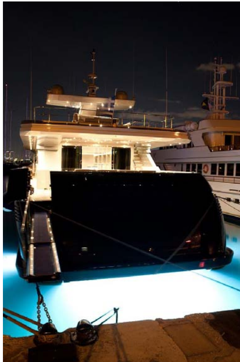
Bow view 2-.JPG