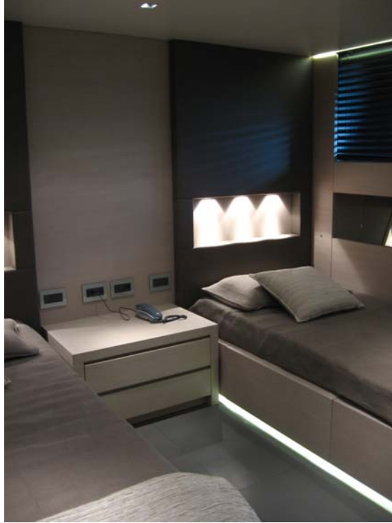
Guest cabin b.jpg